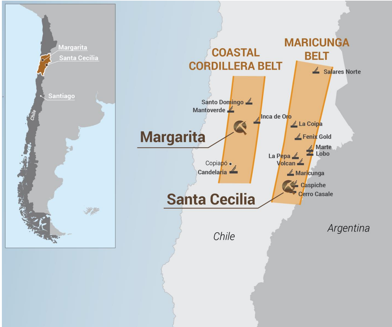
Figure 1: Torq Project Locations